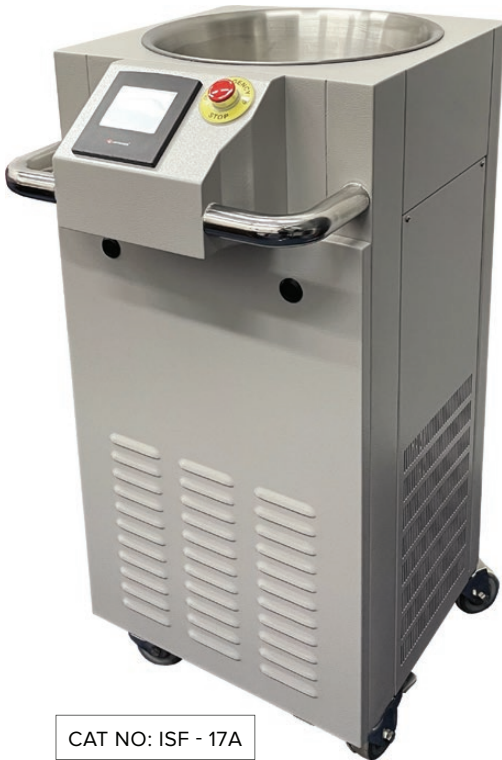
CAT NO: ISF - 17A